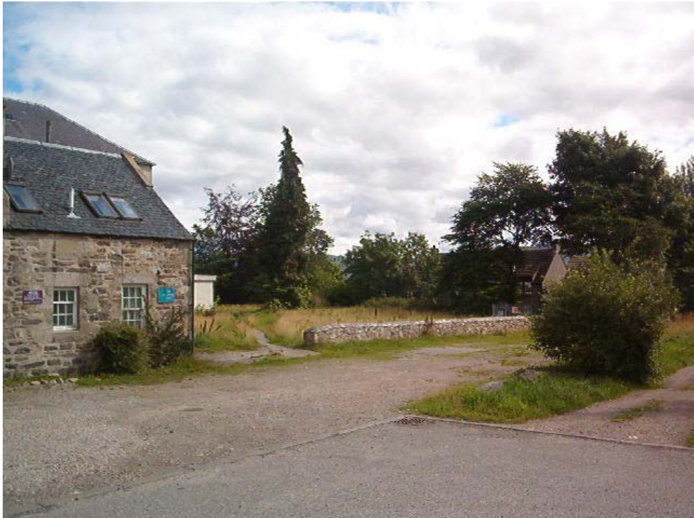
Fig. 2. Site viewed from access road on approach from the Square, existing cottage in foreground.