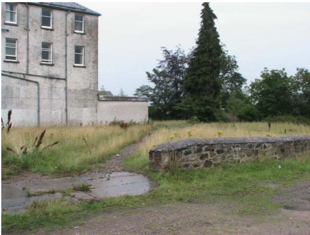
Fig. 3. Site from south west side, modern addition to hotel, (flat roofed extension to be removed).