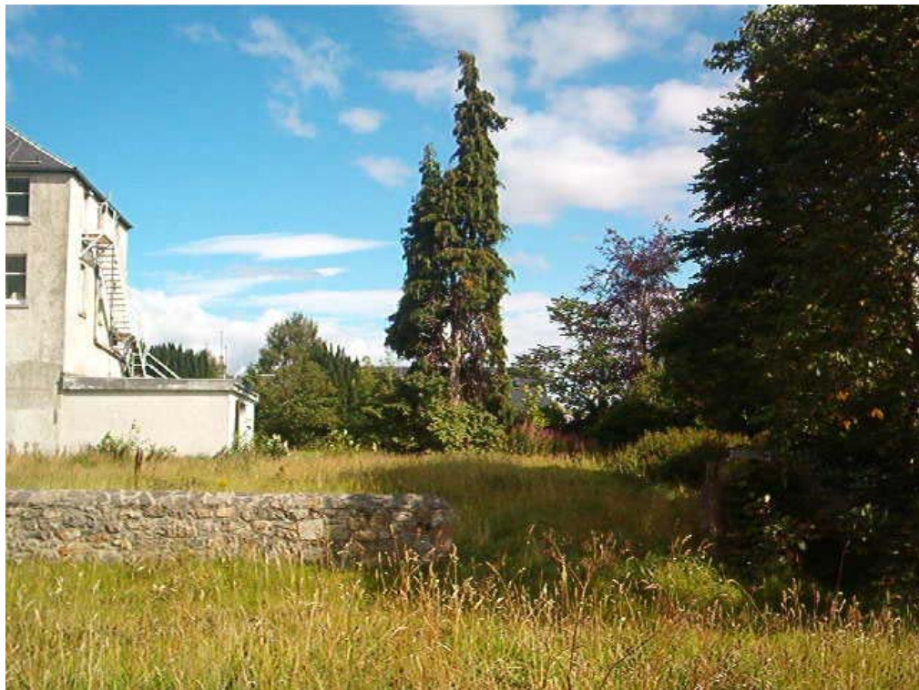
Fig.5. Site from the south side (trees and flat roofed extension to be removed)