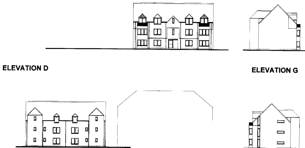
Fig. 7. Indicative Elevations for Flatted Block