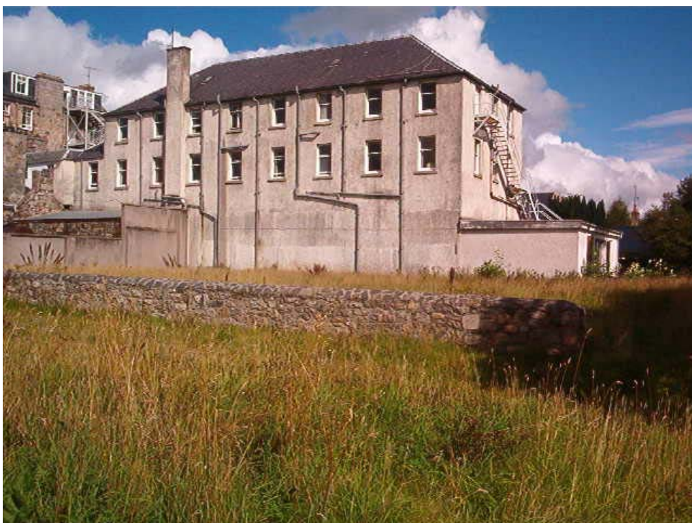
Fig.4. Site viewed from south side, modern addition to hotel, (flat roofed extension to be removed).